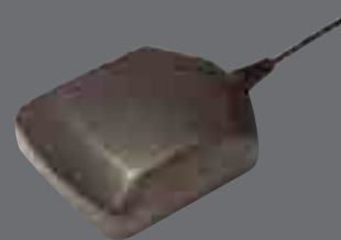
Magnetic mount antenna