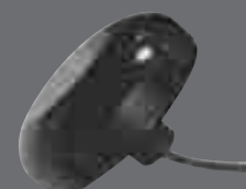
Bulkhead mount antenna