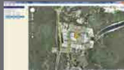
Hummingbird Hawk-I software