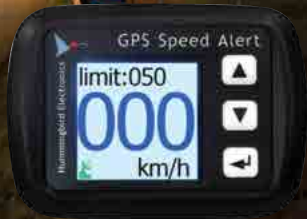
White face mode