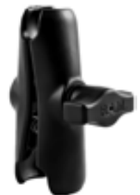
Various length arms