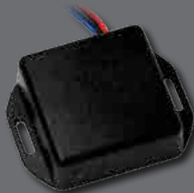
Internal antenna version