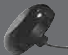
Magnetic mount antenna