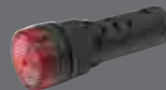
Optional accessory: Combination LED Alarm (HMAC001)