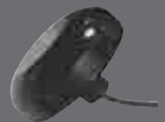
Bulkhead mount antenna