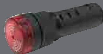
Optional accessory: Combination LED Alarm (HMAL001)