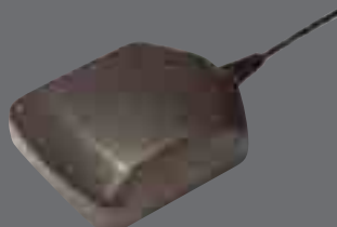
Bulkhead mount antenna