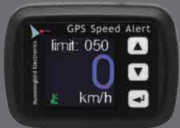
Black face mode