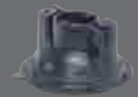
RAM Suction Cup Base