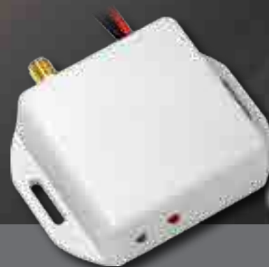
External antenna version