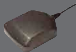
Magnetic mount antenna