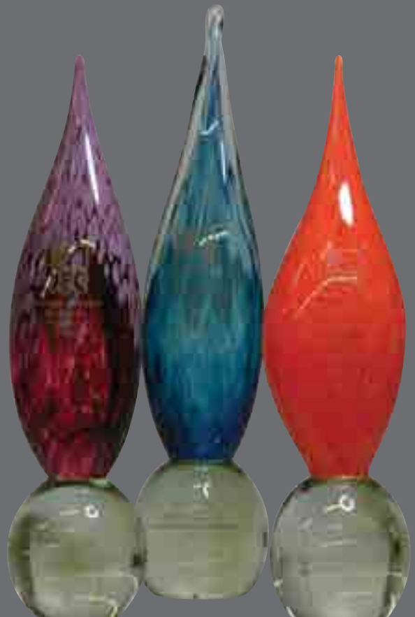
Winner of 3 Innovation Awards