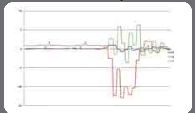
4WD side impact on sedan, 60km/h