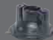
RAM Suction Cup Base